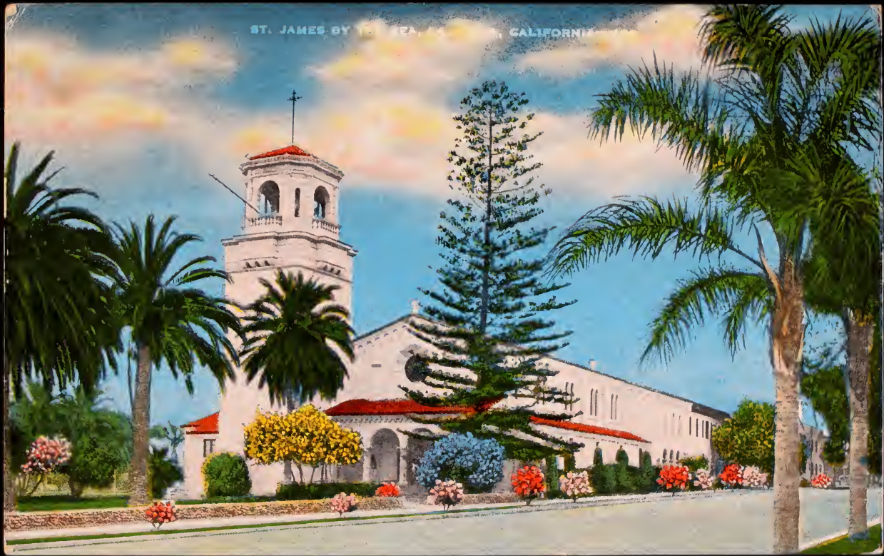
ST. JAMES BY THE SEA, CALIFORNIA